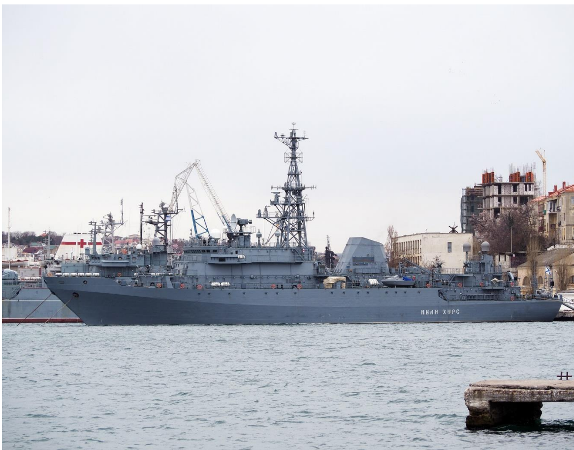
Figure 5. The intelligence ship Ivan Khurs in Sevastopol (12 March 2019)