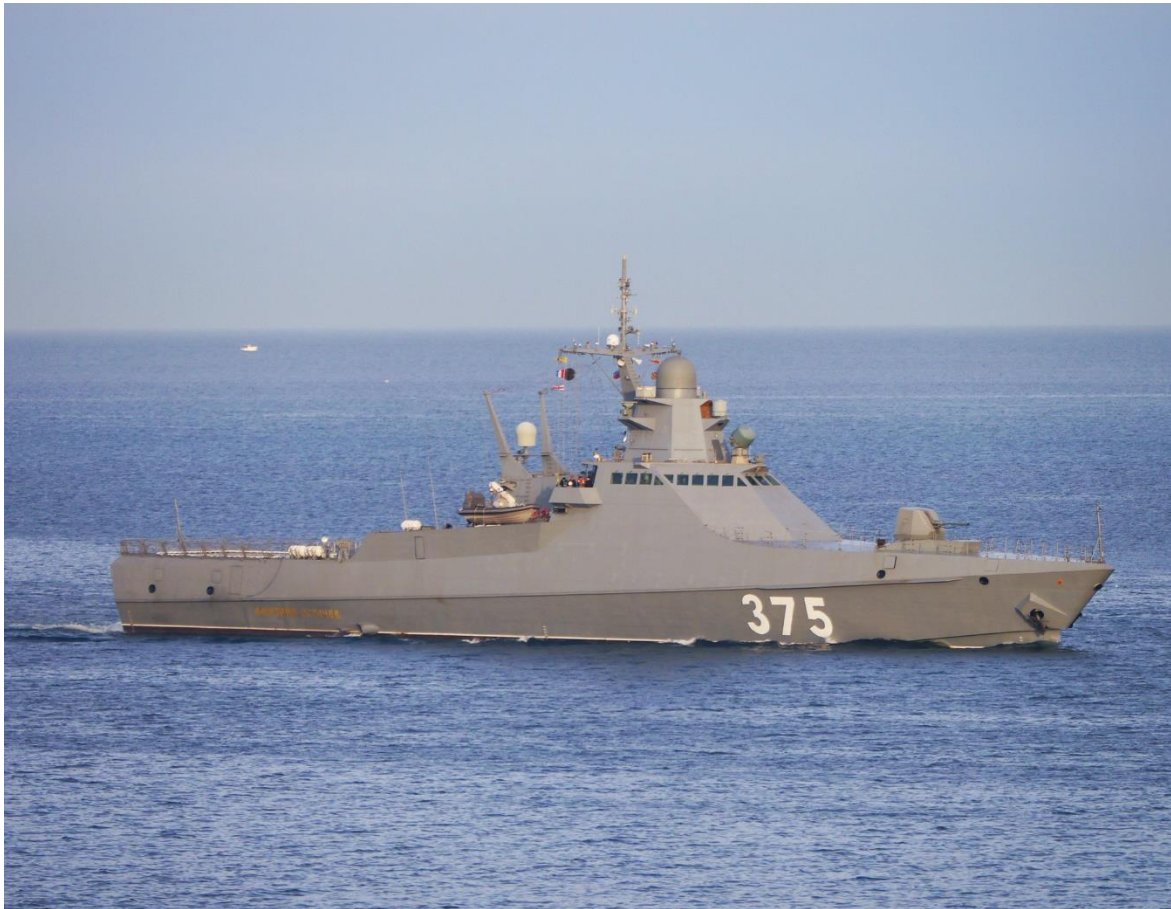
Figure 4. The Project 22160 patrol boat Dmitry Rogachev approaching Sevastopol (4 December 2018)