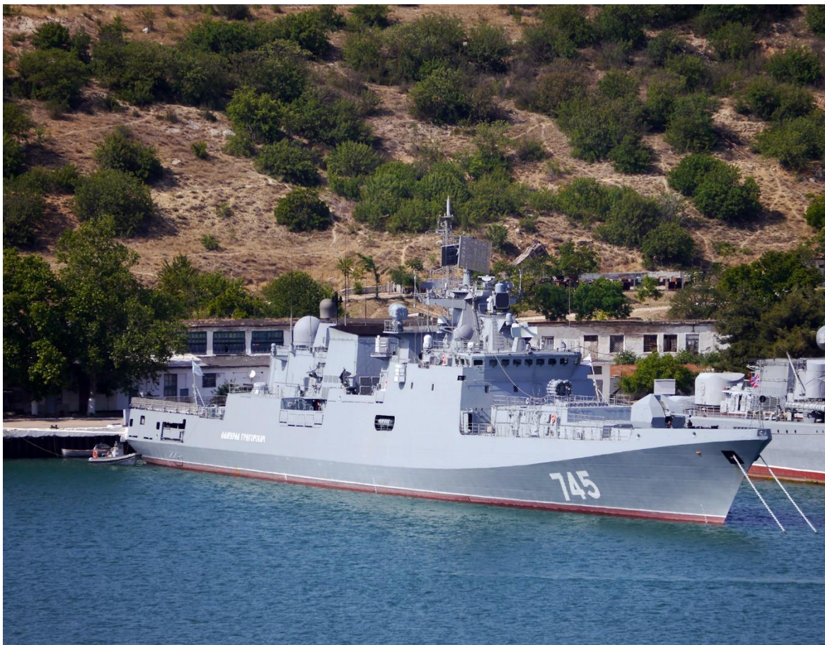
Figure 1. The frigate Admiral Grigorovich moored in Sevastopol (13 June 2016)