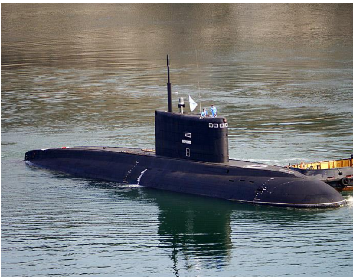
Figure 2. B-261 Novorossiysk (28 September 2015)