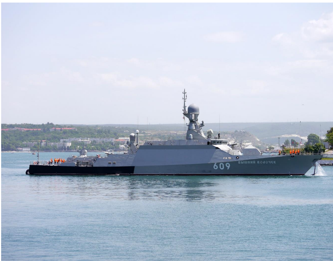
Figure 3. The small missile boat Vyshnyi Volochyok in Sevastopol (28 May 2018)