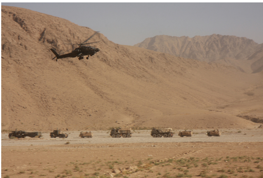
A U.S. Army attack helicopter providing protection for a British convoy in Helmand Province, Afghanistan in August 2008.

However, while the challenges of this transition may be great, the full costs of fossil fuels should compel the nation to search for more reliable, sustainable, and cleaner sources of energy. Moving away from fossil fuel-based energy will not only create a cleaner and healthier future for America, but it will also strengthen the economy and make the nation more secure and prosperous. As President Obama noted in his 2010 State of the Union address, " The nation that leads the clean energy economy will be the nation that leads the global economy and America must be that nation " [12].