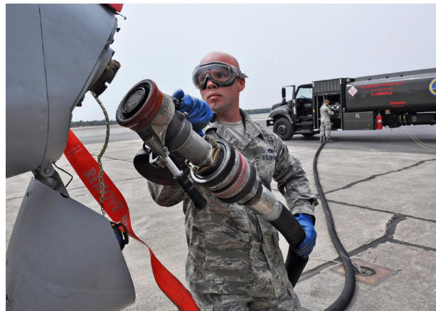
On 25 March 2010, the Air Force fueled and flew this A-10C Thunderbolt II with a 50/50 blend of bio-derived and conventional jet fuel, making it the first military or civilian aircraft to fly with biofuels powering each engine.

cles, acquiring 4,000 neighborhood electric vehicles in 2009; the Army also plans to deploy smart grids on tactical command posts and forward operating bases within five years [36].