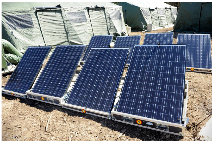
To provide power to Marines in the field, the Office of Naval Research developed this 300-watt photovoltaic battery system, known as the Ground Renewable Expeditionary Energy System (GREENS).

Thus, while the research and development enterprise contributes to making the military forces more effective, its complexity and lack of transparency introduces inefficiency; this inefficiency, in turn, results in a significant slowing of the innovation process in all stages of the pipeline. Furthermore, resulting from the lack of transparency, the services and other components within DOD are often unable to see the research and development efforts being pursued elsewhere. In one example, we learned that a military service had recently approached DARPA with a technology need, only to discover that DARPA had developed the technology ten years earlier.