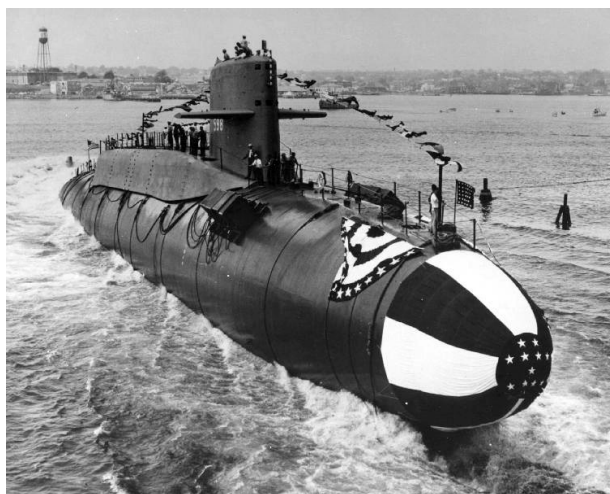
USS George Washington , the Navy's first nuclear-powered fleet ballistic-missile submarine, was commissioned in 1959.

often requires large-scale, complex manufacturing capabilities. Because the transitions from one stage to the next are often fraught with problems, many technologies ultimately perish in what has come to be known, especially in relation to the transition between the demonstration and deployment phases, as the “Valley of Death.”