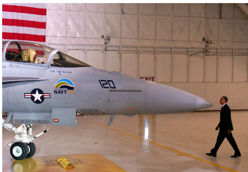
President Obama at Andrews Air Force Base, Maryland, on March 31, 2010, with the U.S. Navy's Green Hornet F/A-18, the first Navy fighter plane to fly on a biofuels blend.

tor, the demand signals are clear and the opportunities are enormous; this is true not only because of the signaled interest but also because of the sheer size of the organization. Consider this: DOD uses nearly 1 percent of all energy consumed in the United States, making it the nation's largest single user of energy; its share accounts for approximately three-quarters of all energy consumed by the U.S. government [37]. So, by focusing on improving its energy posture, DOD can begin the push toward a clean energy economy.