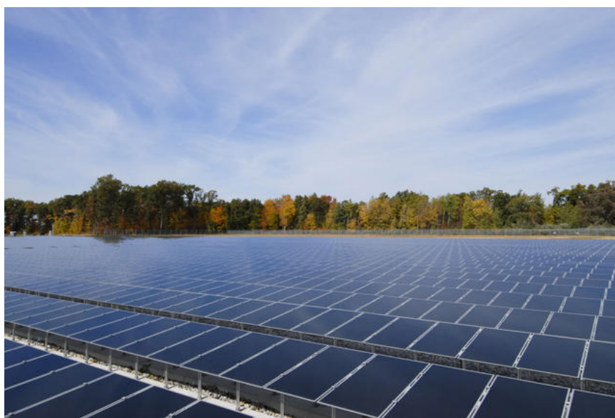
A solar field belonging to the 180th Fighter Wing, Ohio, Air National Guard, a project funded by DOD’s Defense Research and Development Program. Once completed, this field will allow the fighter wing to save approximately 37.5% on its annual electric bill.

The two agencies already cooperate for mutual benefit in some areas. For instance, since 2008, the National Renewable Energy Laboratory (NREL) and the military services have been jointly pursuing net zero bases—that is, bases that produce as much energy as they consume. In other instances, DOE has placed energy advisors at some of DOD’s Combatant Command headquarters. Through these advisors, DOE and DOD have uncovered large areas of common interest. However, to date the relationship between DOD and DOE has been largely ad hoc, usually the result of particularly enterprising individuals.