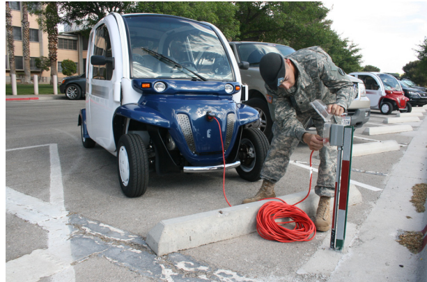
Fort Bliss' command sergeant major's electric car being charged on base.

Recent actions by DOD and the military services confirm their dedication to changing how they use energy. Operationally, the deployment of foam insulation on tents in Afghanistan and Iraq has resulted in significant reductions in the diesel fuel burned by power generators for air conditioning [32]. The Navy and Air Force have both demonstrated jets that use new blends of biofuels [33, 34]. By 2016, the Navy hopes to deploy the "Great Green Fleet," an aircraft carrier strike group powered entirely by nuclear and biofuels [35]. The Marine Corps has mobilized Marine Energy Assessment Teams to analyze energy and water use on forward operating bases, and the Marines are also exploring potential solutions at experimental forward operating bases at Quantico, Camp Pendleton, and Twenty-Nine Palms. The Army is a leader in pursuing alternatives to traditional non-tactical fleet vehi-