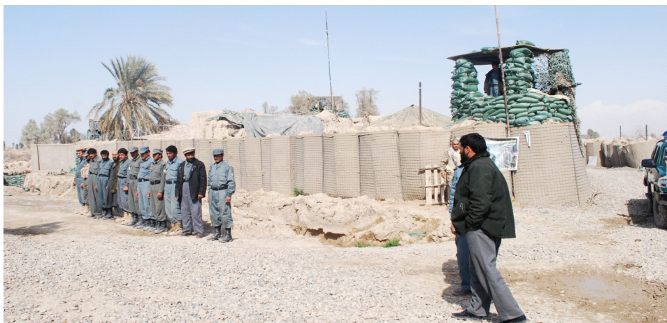
Figure 4. Omar Jan, Garm Ser district police chief, inspecting a patrol base with police and arbakai guards in March 2011 a

One way to get the benefits of local and non-local police is to have locally recruited police patrolmen serving under officers from other areas (figure 4). If these officers are willing to engage with the local leaders and the public, they may be able to make objective decisions while also understanding local issues.