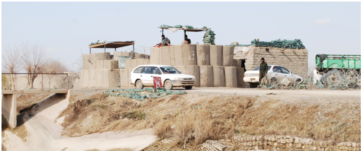
Figure 2. Police checkpoint along a main road through Garm Ser district, February 2011 a

River Valley and in much of northern Helmand. As shown in figure 2, however, these “checkpoints” are nothing like the temporary sobriety checkpoints police set up in America. Instead, police mentors interviewed for this study used the terms “patrol bases” and “checkpoints” interchangeably to mean fixed positions with permanent buildings where 10 to 20 police live and work. These positions include living quarters, an area for cooking, and a latrine, and they are called “checkpoints” because most of them are located along main roads or at entrances to bazaars or schools so the police can search passing vehicles for IEDs, weapons, or drugs. As “patrol bases,” these positions also provide the police with staging grounds for conducting police patrols.